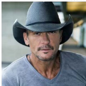
Photo from Tim McGraw website

Have you heard Tim McGraw's new song Humble and Kind (written by Lori McKenna)?